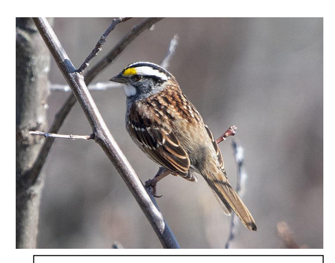
White-throated Sparrow

Microphones : Mics need to be condenser type mics like the Behringer C-2 Studio Condenser Microphones $70. There are two mics in this package so you can place each mic in its own perfect location or connect them in stereo with the included stereo bracket. Condenser mics must be powered by "phantom power." Phantom power will be automatically provided by the amplifier I suggest below. Condenser mics powered by phantom power are much more sensitive and very good at picking up faint bird sounds. These mics also have a directional ability (Cardioid pickup pattern). They only listen to sound from the direction you point them. That is good for avoiding noisy directions. They also have a "Low Frequency Roll Off" switch and include spongy wind screens so that the low rumble from the wind is greatly reduced.