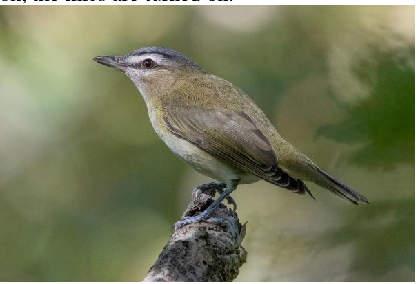
Red-eyed Vireo

For almost 40 years, our home has been wired for bird sounds. We have two microphones mounted outside, one pointed towards our feeders, the other towards good nearby habitat. Each morning, year-round, often even before the coffee pot gets turned on, the mics are turned on.